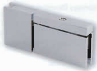
Cat. No. CAR07

For 3/8" and 5/16" (8 mm and 10 mm) Glass