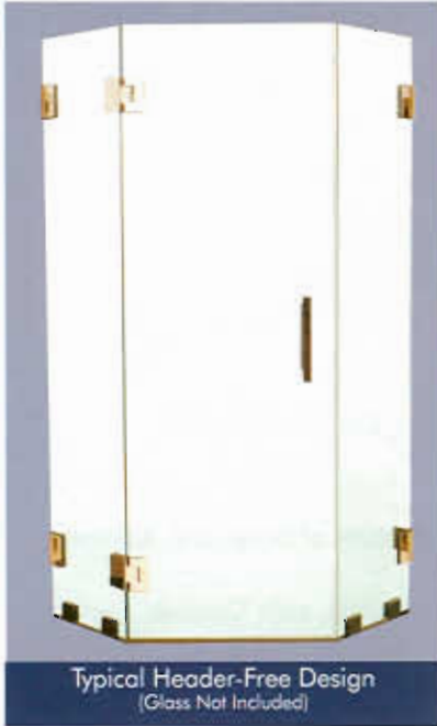
Typical Header-Free Design (Glass Not Included)