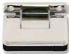
Cat. No. PTC037 BEVELED EDGES