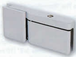
Cat. No. PPH07

For 3/8" and 5/16" (8 mm and 10 mm) Glass