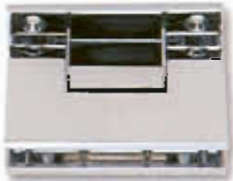
Cat. No. GTC037 SQUARE CORNERS