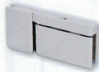
Cat. No. SRPPH07