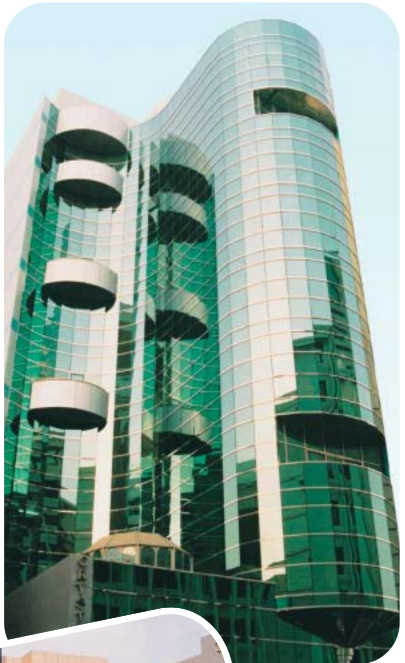
Pilkington Eclipse Advantage™ EverGreen