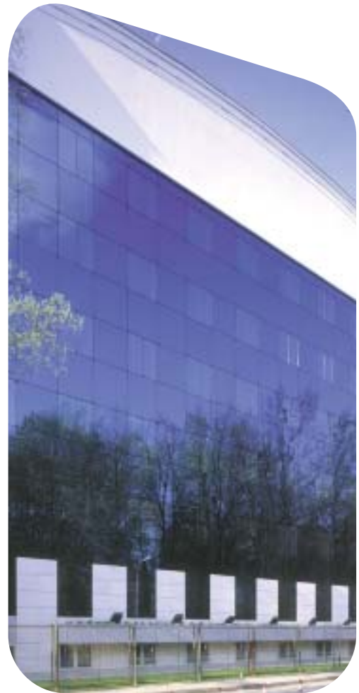
Pilkington Eclipse Advantage™ Arctic Blue

As Pilkington Eclipse Advantage™ is a pyrolytic rather than a soft coating, there are no significant changes to its properties when toughened or bent.