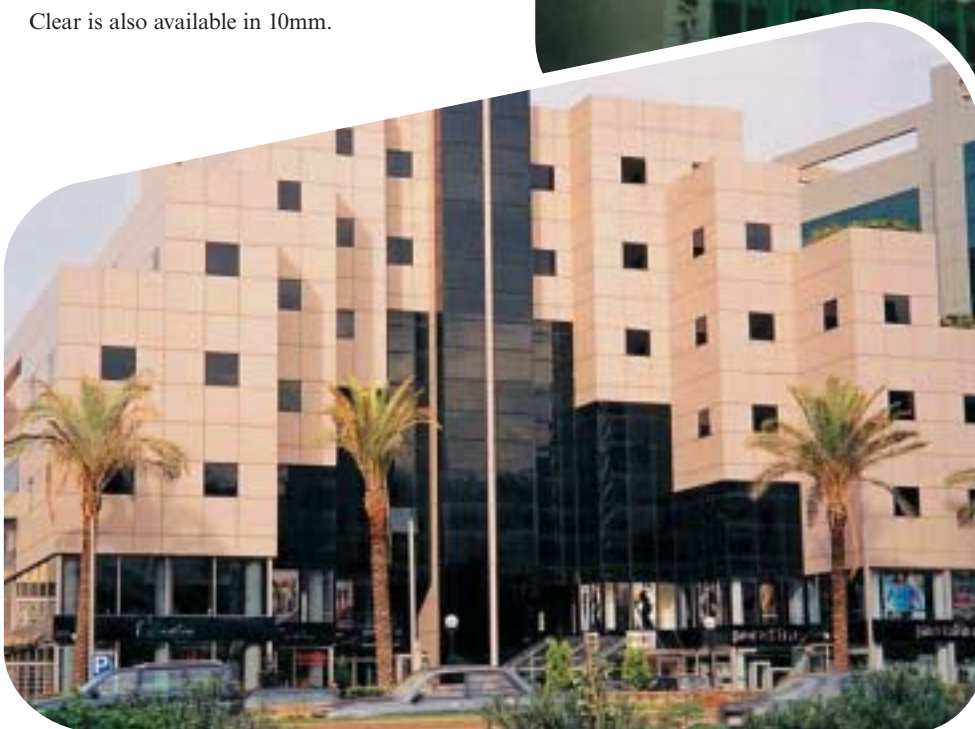
Pilkington Eclipse Advantage™ Grey