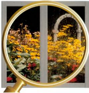
The hydrophilic action of Pilkington Activ TM Self-Cleaning Glass (left) causes water to sheet rather than spot, as it does on ordinary glass (right).